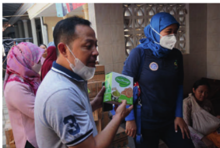
Figure 1. Dissemination of the benefits of Moringa biscuits.

The data collection was carried out three times. The evaluation was carried out once a month by measuring the weight, height, and condition of any infection in children after consuming moringa biscuits. Height and weight were measured using a microtome and a digital scale standardized by the Ministry of Health of the Republic of Indonesia. The data on weight and height were analyzed using