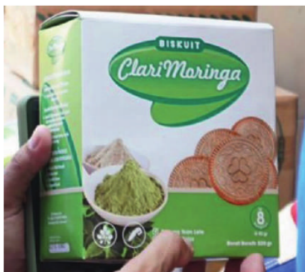
Figure 2. Moringa biscuits

univariate and multivariate tests on SPSS and presented in a graphical form.