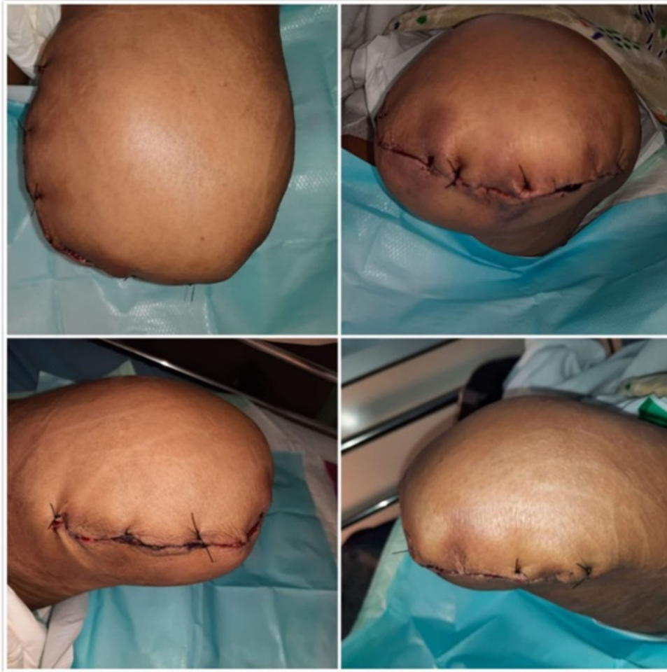
Figure 3. The appearance of left lower limb post amputation. Two days post-surgery, the patient was safely discharged and followed up regularly for recurring symptoms at the outpatient clinic.

Hb 10.3, leucocyte count 22610/ \mu L, platelet 509000/ \mu L, D-dimer 3960 ng/ml and random blood glucose of 171. Subsequently, the patient received 8 lpm oxygen through a simple mask, diet type-B 1900 kcal/24 hours, iv fluid with NaCl 0.9% 1000 ml/24 hours, cefoperazone sulbactam 2 \times 1 g iv, subcutaneous novorapid 14 – 16 – 16 unit, subcutaneous levemir 0 – 0 – 10 unit, subcutaneous heparin 2 \times 5000 unit and oral cilostazol 1 \times 100 mg. At day 13, her blood pressure was 127/70 mmHg, heart rate 90 bpm, respiratory rate 20 times/minute and SpO 2 98%. Laboratory results showed Hb 9, leucocyte count 11800/ \mu L, platelet 410000/ \mu L, BUN 20 mg/dl, serum creatinine 1.3 mg/dl and random blood glucose of 160. The eGFR was 45 ml/min/1.73 m 2 (stage 3A). At this point, the patient was assigned for antegrade right femoral artery thrombectomy and left above-knee amputation at the following day. At day 14, the surgeries (both amputation and thrombectomy) were performed (Figure 3) and 10 cm thrombus was retrieved in the right femoral artery. Lastly, as a follow-up, at day 17, no symptoms were observed, therefore the patient was discharged.