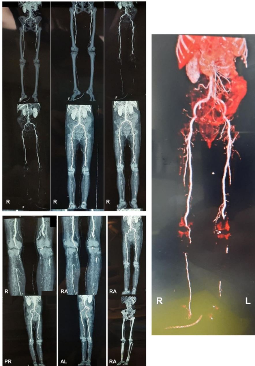
Figure 2. The computed tomography angiography (CTA) of the lower extremity. The CTA revealed an abdominal aortosclerosis with abnormalities on both limbs. Right limb: total occlusion due to 6 cm thrombus on right popliteal artery (from 1 cm above right femorotibial joint toward inferior), right anterior tibial artery received contrast flow from collateral arteries and no contrast flow was seen in right posterior tibial, peroneal and dorsalis pedis arteries. Left limb: total occlusion due to 12.7 cm thrombus on left popliteal artery (from 6 cm above left femorotibial joint toward inferior). No contrast flow was seen in left anterior tibial, posterior tibial, peroneal and dorsalis pedis arteries. (This figure has been edited in Microsoft PowerPoint 2016 to obscure patient's data.)