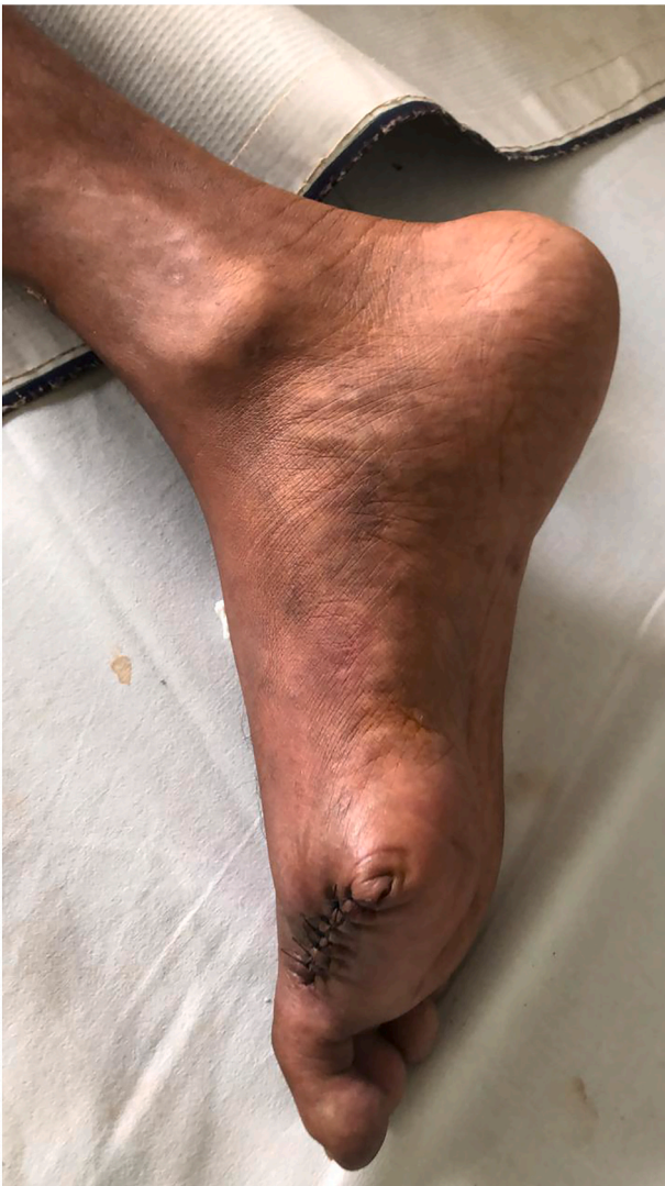
Fig. 2. Comparison of digit I pedis amputation before and after surgery.