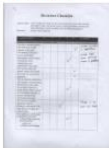
JUXTA 028 Lutfi_Reviewer Checklist_1.jpeg 1032K