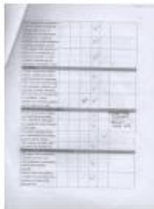
JUXTA 028 Lutfi_Reviewer Checklist_2.jpeg.jpeg 1053K