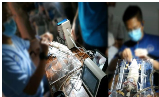
Figure 4: The position of the intubation operator when performing the action. Note that the anvil is tilted 45° during action.

The intubation operator opened the rats' mouth with their right hand and rolled their tongue out using a cotton swab. The operator's left hand enters the intubation device. The airway is visualized on a telephone screen respectively the cavity oropharynx, then the larynx of the vocal cords. The vocal cords were moistened with 2% lidocaine local anesthetic using the tip of a cotton swab. After the vocal cords are anesthetized by fear of opening the vocal cords, the endotracheal tube (16G intravenous catheter) is inserted using a conveyor. After the catheter is inserted into the trachea, the insert cannot be removed, and the intubation device is removed from the oral cavity. Then the endotracheal tube is connected to the oxygen source. The position of the operator when performing the procedure can be seen in Figure 4.