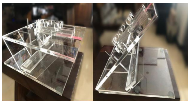
Figure 3: Tilt-adjustable acrylic intubation base

rats were sedated and limp, an ECG monitor electrode was placed on the chest and thighs and peripheral oxygen saturation in the tail. The rat is positioned supine dorsally (half lying 30-45°) with the head above. As fixation, the upper incisors of the rats were treated using rubber on an intubation base. A tilt-changeable base is used as the basis for the action of intubation (Figure 3).