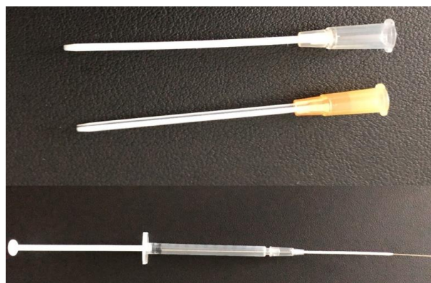
Figure 2: The endotracheal tube uses a 16 G intravenous catheter

This tip can be made of a syringe cap that is curved using heat, is smoothed, and curved at the tip to prevent injury to the rat's airway. The power source in this otoscopy is obtained from a mobile phone which also functions as a screen to display images. As a tool to reveal the tongue, a cotton swab was used to roll the rat's tongue outwards. The endotracheal tube used was a 16 G intravenous catheter which was directed using an introducer made of blunt-tipped wire (Figure 2). The introducer uses a blunt-tipped wire which is glued to a 1 ml syringe for ease of use.