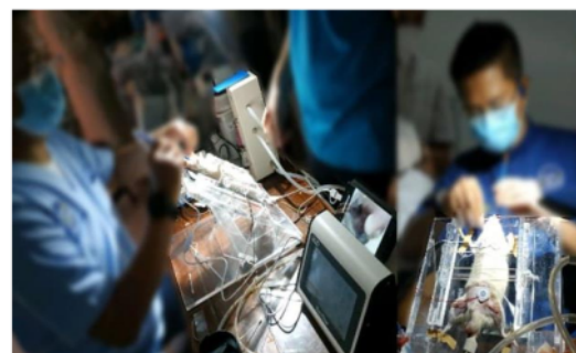
Figure 4: The position of the intubation operator when performing the action. Note that the anvil is tilted 45° during action.

The intubation operator opened the rats' mouth with their right hand and rolled their tongue out using a cotton swab. The operator's left hand enters the intubation device. The airway is visualized on a telephone screen respectively the cavity oropharynx, then the larynx of the vocal cords. The vocal cords were moistened with 2% lidocaine local anesthetic using the tip of a cotton swab. After the vocal cords are anesthetized by fear of opening the vocal cords, the endotracheal tube (16G intravenous catheter) is inserted using a conveyor. After the catheter is inserted into the trachea, the insert cannot be removed, and the intubation device is removed from the oral cavity. Then the endotracheal tube is connected to the oxygen source. The position of the operator when performing the procedure can be seen in Figure 4.