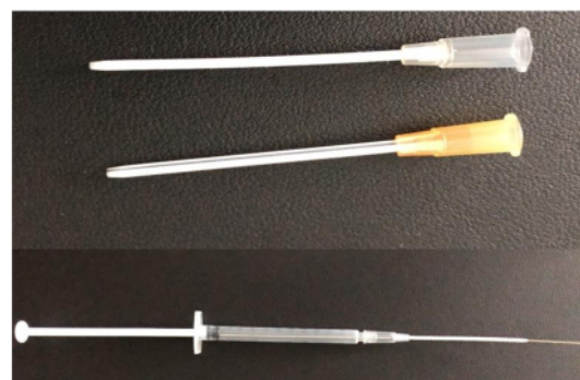
Figure 2: The endotracheal tube uses a 16 G intravenous catheter

This tip can be made of a syringe cap that is curved using heat, is smoothed, and curved at the tip to prevent injury to the rat's airway. The power source in this otoscopy is obtained from a mobile phone which also functions as a screen to display images. As a tool to reveal the tongue, a cotton swab was used to roll the rat's tongue outwards. The endotracheal tube used was a 16 G intravenous catheter which was directed using an introducer made of blunt-tipped wire (Figure 2). The introducer uses a blunt-tipped wire which is glued to a 1 ml syringe for ease of use.