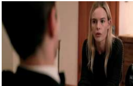
Figure 9 (01:12:10)

To the film director, lighting is more than illumination that enables the viewer to see the action. Lighting, like the other aspects of mise en-scene, is a tool used by the director to convey special meaning about a character or the narrative to the viewer. Lighting can help defining the setting of a scene or accentuate the behavior of the figures in the film. The quality of lighting in a scene can be achieved by manipulating the quality and the direction of the light. If a director wishes to conceal the identity of a particular character in a scene, he backlights the figure to allow the viewer to see only the outline of the character's body like the picture below.