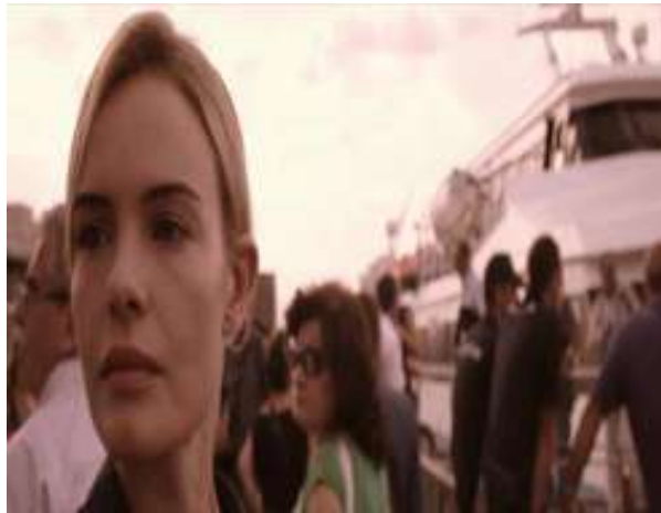
Jane while she has trip to Ischia

Jane is the main character in And While We Were Here movie. A beautiful newlywed American woman, Jane is working on transcribing tapes she has made of her grandmother's memories of her life. She is a freelance writer working on a book about her grandmother's experiences in England during the two world wars. Throughout the film she listens back to her recorded conversations with grandma, which have an uncanny way of commenting upon her present circumstances. While Jane is experiencing a war within her marriage, she is able to listen to the actual war that her grandmother experienced and feel their feelings.