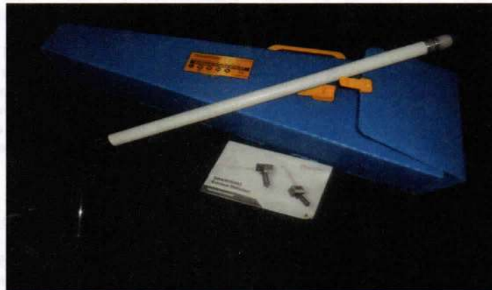
Figure 1 Draminski Heat Detector, Poland

Research was conducted in some farm area: Surabaya, Gresik, Pasuruan, Tuban, Batu, Kediri and Pujon. It was done within 9 month, from February to November 2014. Estrous synchronization was done to 40 head of cows with twice injection PGF2 \alpha in submucose of vulva. Estrous cows then grouped into 4 with each group consisted of 10 head. Control group was inseminated by sexing semen ("Male sperm") in best time of insemination. Time determination using Heat Detector as shown in Figure 1.