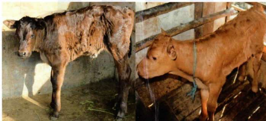
Figure 5 Born Calves

Result of insemination by both using sexing and unsexing sperm shows no significant different.