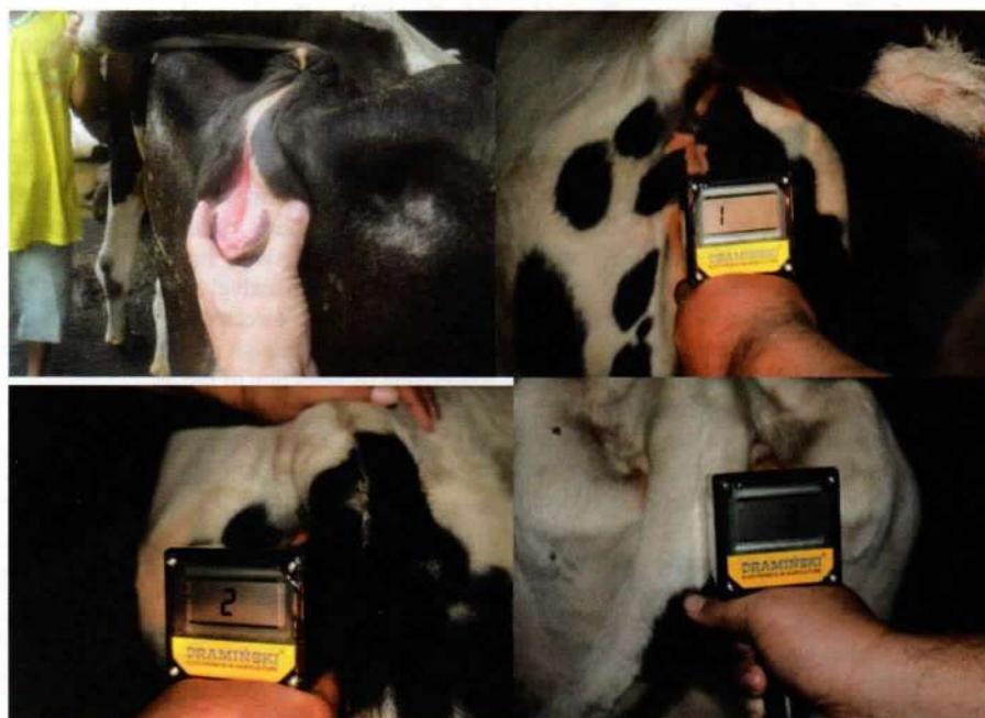
Figure 2 Detection of Estrous Using Heat Detector 1-Early to inseminate; 2-The best time to inseminate; 3-Too late to inseminate

Observed parameters in this research were pregnancy rate (detected by rectal palpation), calves born sex, time of calves born.