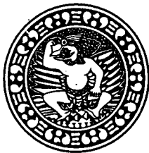
FACULTY OF VETERINARY MEDICINE AIRLANGGA UNIVERSITY