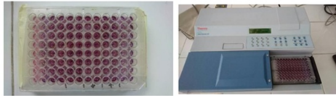
Figure 1. Cytotoxicity test on 96 well plates that was monitored by ELISA reader

The data result was then tabulated based on each groups, and tested by One-Way ANOVA with 5% level of significance. If there was significant difference, LSD test would be done.