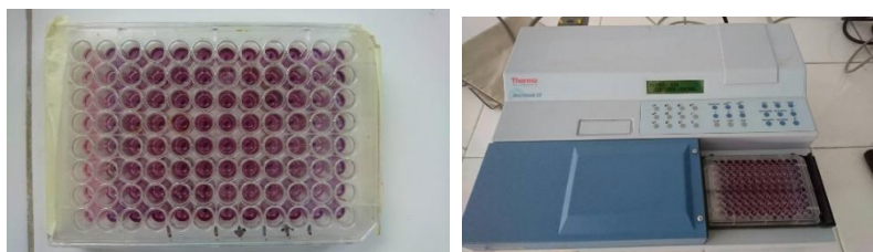
Figure 1. Cytotoxicity test on 96 well plates that was monitored by ELISA reader

The data result was then tabulated based on each groups, and tested by One-Way ANOVA with 5% level of significance. If there was significant difference, LSD test would be done.