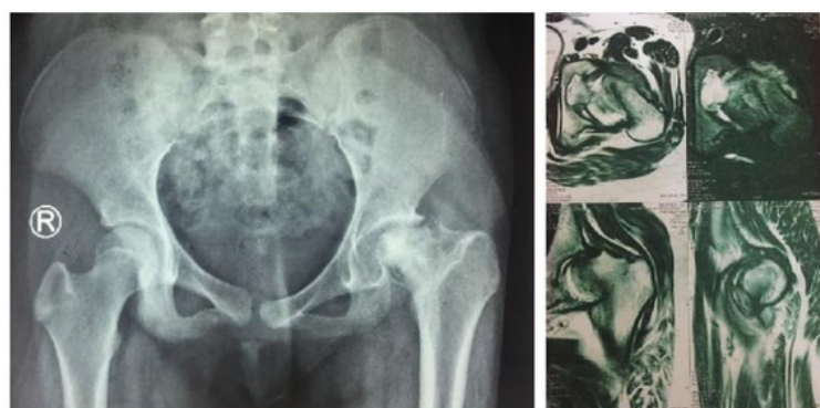
Figure 2 Right: (a) X-ray of pelvic view: migration proximally of the femur and collapse of the head of the femur; (b) left MRI deformity, subluxation, and impaction of the femoral head toward the superior and synovitis of left hip enhanced by contrast administration.

Post-operative follow-up treatment. Antibiotics and analgesics were given for two days, and a rehabilitation program was chalked out and implemented, and the program was carried out 6–12 hours after the operation and was continued for 24 hours. The program consisted of isometric and isotonic rehabilitation procedures, and the patient was subjected and familiarized to partial weight-bearing using the double crutch. After 2 days drain was removed, and the catheter was removed after 3 days. Patient's stay at the hospital lasted for 3 days, and during this period she underwent the weight-bearing procedure to get used to being mobile using the double crutch. Postoperatively the leg length discrepancy was reduced to 1 cm, and the patient had already started non-weight-bearing mobilization using a walker 3 days after the operation, and the patient was able to sit properly. The histopathology slides