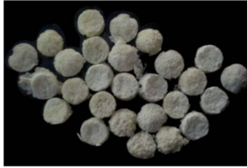
Fig. 1. Result of scaffolds making process using freeze dry method

BHA-GEL-K scaffolds, made of bovine hydroxyapatite, gelatin, chitosan, NaOH, and acetic acid, are shown in Fig. 1.