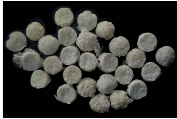
Fig. 1. Result of scaffolds making process using freeze dry method

BHA-GEL-K scaffolds, made of bovine hydroxyapatite, gelatin, chitosan, NaOH, and acetic acid, are shown in Fig. 1.