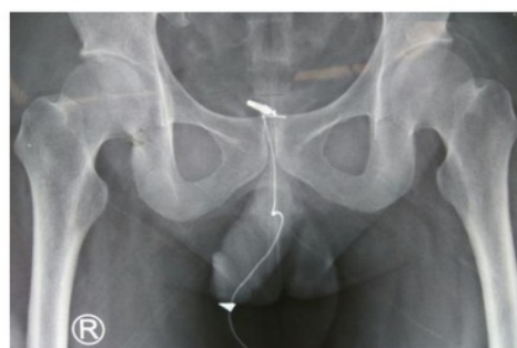
Fig. 1. Plain abdominal radiograph showing a metallic foreign object image in urinary vesicle.