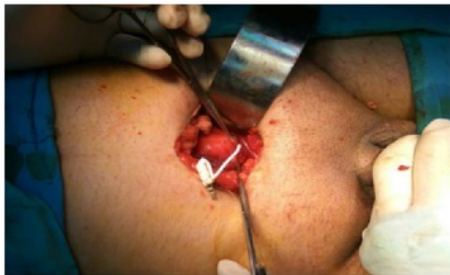
Fig. 4. Open vesicotomy, headset extraction