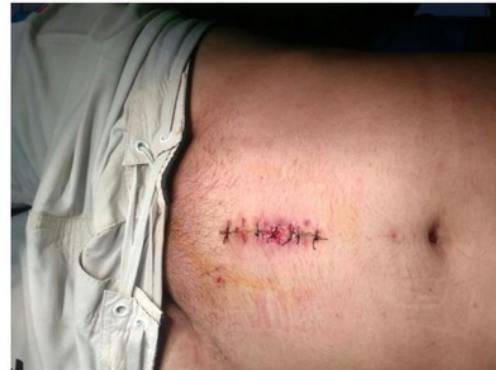
Fig. 6. Vesicotomy surgical wound

After surgery, the patient was observed to see vital signs, complaints, urine production, and drainage in the room. One day after surgery, drain production was 48 cc/24 hour hemorrhagic. On the sixth day the drain was released. On the seventh day, after surgery, the patient had been able to mobilize well. Complaint of pain was minimal and no other significant complaints were found. Patients were scheduled to visit the clinic three days later.