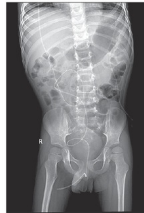
Figure 2: Abdominal X-ray shows the extruded ventriculoperitoneal shunt catheter through the urethral orificium

The exact mechanism of the bladder perforation is not fully understood yet. [3,7,8] There have been various theories proposed such as bioreactivity, local inflammation, infection, and surgical error. [3,7-9] The contribution of host factors includes young age and malnutrition. The location of the bladder makes it highly unlikely site of perforation, as the catheter must pass