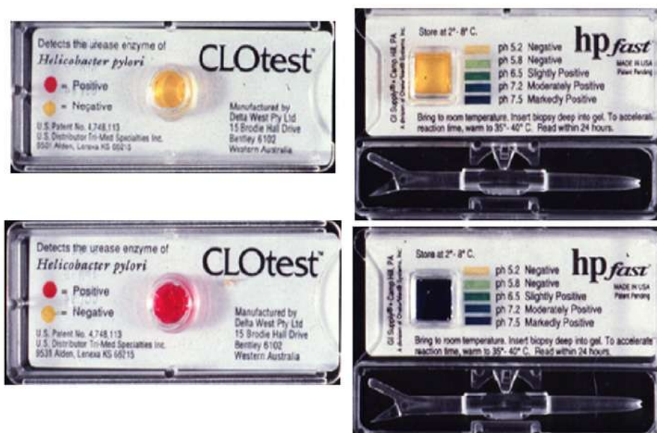
Fig. 1. Examples of commercial rapid urease tests commonly available in the United States. The CLOtest ® and a second generation test, the hpfast ® test are shown. Both use urea impregnated agar and a pH indicator system. The upper one of each pair is the control and the lower shows the color change indicating probable H. pylori infection.

The sensitivity of various RUT tests as primary diagnostic tests is high and has been reported to vary between approximately 80% and 100% with a specificity between 97% and 99% [40,48]. The sample imbedded in the gel can also subsequently be used for additional testing. For example, the sample can be used for molecular testing for antimicrobial susceptibility [49,50].