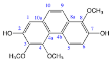
Fig. 1. Chemical structure of confusarin ( 1 ).

The ^{13}\text{C-NMR} spectrum ( \text{CDCl}_3 , 100 MHz) reported in Table 1 shows 16 perfectly separated carbon signals. The signals refer to eight quaternary carbons ( \delta_{\text{C}} 153.2 ppm, 150.7 ppm, 147.5 ppm, 140.9 ppm, 133.5 ppm, 129.6 ppm, 124.3 ppm and 118.9 ppm), four quaternary