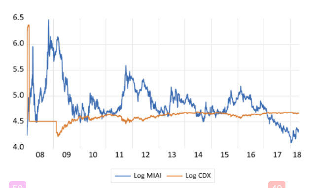
Fig. 1. A time-series plot of credit risk price series. This figure plots the timeseries data for the log of the Markit iTraxx Asia index (MIAI) and the global CDX high yield index.

credit risk market contributed by the stock market. In other words, GG1 and HAS1 give the percentage of price discovery in the credit risk market contributed by the stock market.