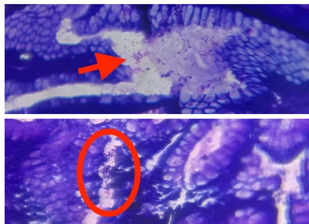
Figure 1. H. pylori were examined through light microscope using x40 objective lens with Modified Giemsa (Diff Quik) staining. Circle and red arrow = H. pylori

An equal number of patients between male and female patients was observed in marked H. pylori density, although there was no statistical significant correlation between gender and H. pylori density in gastric mucosa ( p = 0.996 ). H. pylori was observed in spiral form and in blue-greyish colour. The histological appearances are shown in Figure 1.