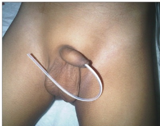
Figure 1: Extruded shunt was exposed through the external urethral orificium