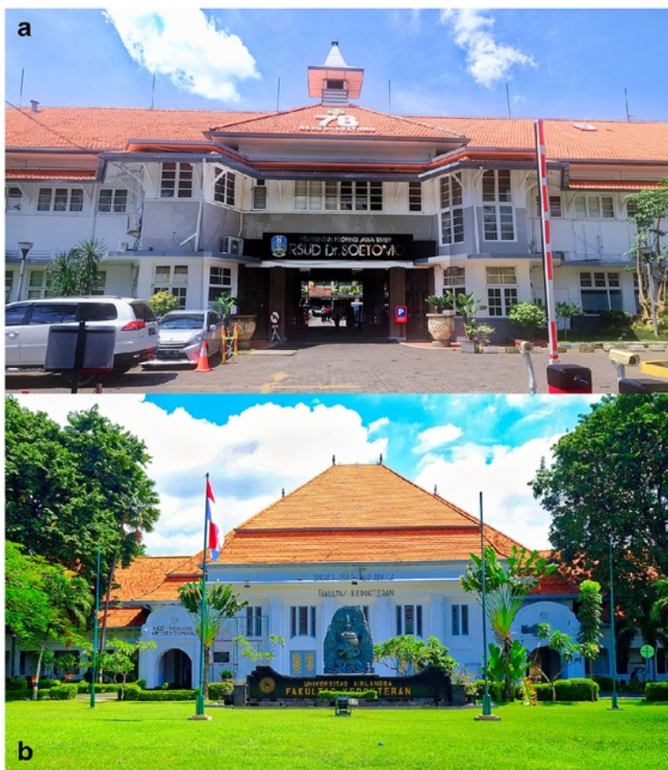
Fig. 1 a The front gate view of Dr. Soetomo General Hospital, Surabaya, (2016). b The front view of Universitas Airlangga Faculty of Medicine (2016)

they made an agreement to share the workload, pooled all the income from clinical work, and shared among four neurosurgeons. This kind of practice plan was the first of its kind in the hospital. Over time, each member showed interest in specific field. Neurovascular, brain tumor, and spine surgery attracted more interest than other areas, including pediatric and trauma.