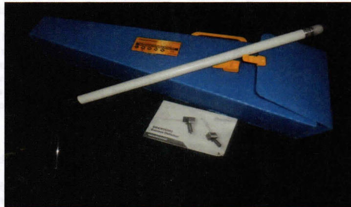
Figure 1 Draminski Heat Detector, Poland

Research was conducted in some farm area: Surabaya, Gresik, Pasuruan, Tuban, Batu, Kediri and Pujon. It was done within 9 month, from February to November 2014. Estrous synchronization was done to 40 head of cows with twice injection PGF2 \alpha in submucose of vulva. Estrous cows then grouped into 4 with each group consisted of 10 head. Control group was inseminated by sexing semen ("Male sperm") in best time of insemination. Time determination using Heat Detector as shown in Figure 1.