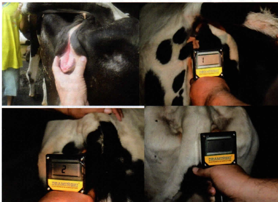
Figure 2 Detection of Estrous Using Heat Detector

1-Early to inseminate; 2-The best time to inseminate; 3-Too late to inseminate