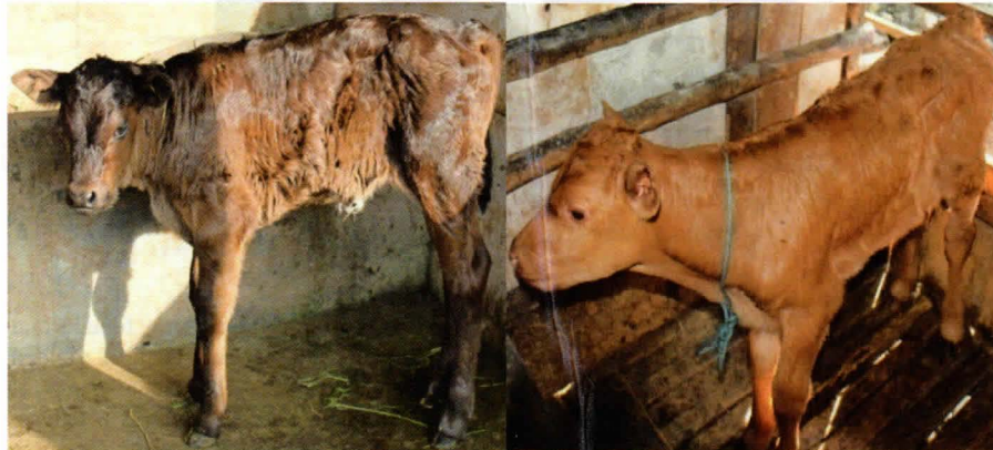
Figure 5 Born Calves

Result of insemination by both using sexing and unsexing sperm shows no significant different.