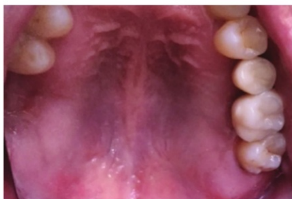
Figure 6. Splint crown insertion.