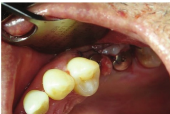
Figure 3. Clinical view after implant placement in region 25 and 26.

Case selection in implant treatment is the key to success. Placing implant on the maxilla have some challenges, namely bone volume and maxillary sinus floor. The maxilla