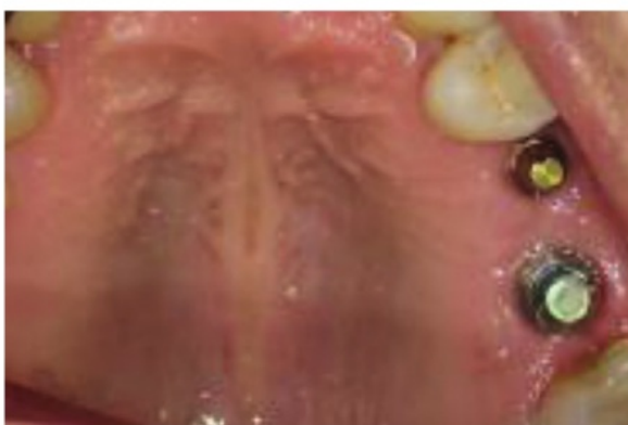
Figure 5. Abutment insertion in 25 and 26 implant.