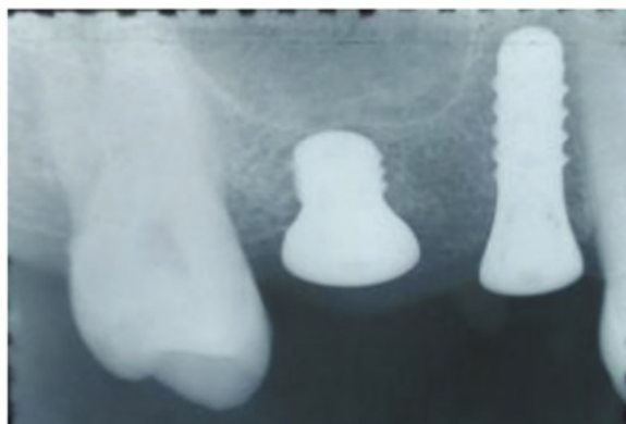
Figure 4. Radiographic evaluation of post implant placement in region 25 and 26.