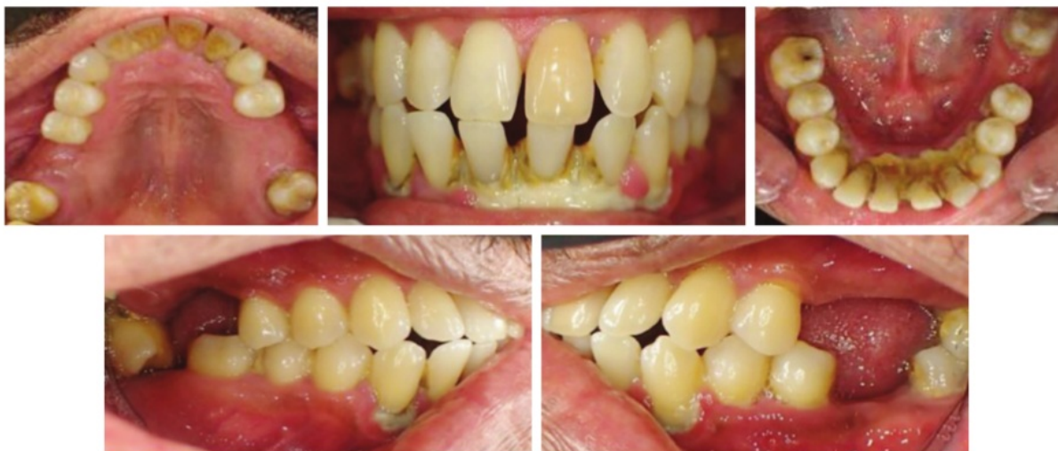
Figure 1. The intraoral clinical view.

type III gypsum. A CBCT analysis was then performed and found that the mesio-distal alveolar width in the 25 and 26 edentulous area was 16.69 mm. In the 25 edentulous region, the alveolar crest to maxillary sinus floor width was 10.78 mm, the bucco-palatal alveolar width was 9.31 mm and the alveolar thickness was 9.48. In the 26 edentulous region, the alveolar crest to maxillary sinus floor width was 5.41 mm, the bucco-palatal alveolar width was 10.51 mm and the alveolar thickness was 11.32. The CBCT result is