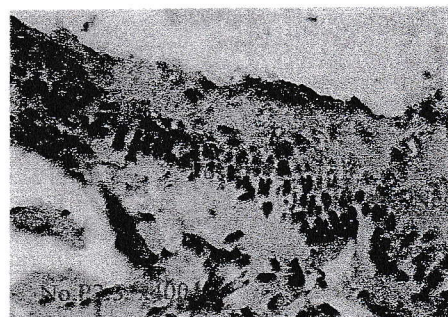
Fig. 2. Apoptosis cell on P2 group. Neg=negative, Pos=positive.

abc =The same superscript showed no different between group (based on LSD test)