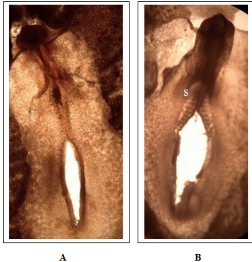
Figure 1: Chicken embryo after 24 hours incubation. A. Control . B. infected with T. gondii S: somite.