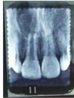
Picture 2. Radiographic initial overview of tooth 11