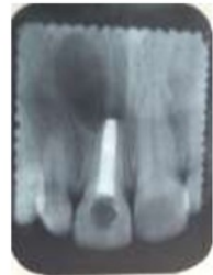
Picture 5. The radiographic overview of gutta-percha backfill obturation thermoplastis.

On the third visit (2 weeks later), apical dental examination on tooth 11 to make sure the MTA had hardened. Then the remaining root canal was filled using gutta percha thermoplastis back-gill (VDW, Beefill 2 in 1, USA) with a resin sealer (Top Seal), then the cavity was given cotton and filled temporarily with Cavit. This was followed by radiographic photo to ensure that the root canal was filled perfectly and looks hermetic (Picture 5).