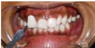
Picture 7. post-treatment of internal bleaching control (2 months)

After giving endo opalescence 35% hydrogen peroxide for 4 times (for 4 weeks), it was obtained the tooth color which matched with the teeth next to it; that was based on the Vita 3D shade guide color 1M1. Then the bleaching material was taken, the pulp chamber was cleaned and irrigated with saline then cavity on the palate was prepared for a permanent restoration. After that, the 35% phosphoric etching asthma (3M, ESPE) on the tooth cavity 11 for 15 seconds was given. Then it was rinsed, applied bonding material (XP Bond) and irradiated for 20 seconds. For the final restoration on tooth 11, composite resin restorations (3M Z350XT) was used because Then it was rinsed, applied bonding material (XP Bond) and irradiated for 20 seconds. For the final restoration on tooth 11, composite resin restorations (3M Z350XT) was used because after root canal treatment, the rest of tooth tissues was still quite a lot of , then resin composite irradiated for 20 seconds. Next, the finishing and polishing were done. On the next visit, after 2 months, post-treatment for control of internal bleaching was administered. On the subjective examination, was obtained the results that no complaints from the patient and she was very satisfied with the treatment results. While the objective examination was obtained that the color of tooth 11 did not change and matched the color of the 3D Vita shade guide 1M1. Composite filling was in good condition and gingiva around the tooth was normal (Picture 7).