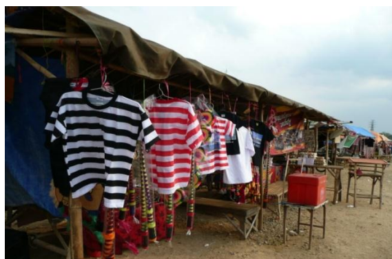
Plate 3. Stall around Suramadu Bridge, Bangkalan

The study found that there are some people who are actively involved in entrepreneurial activities as shown in Plate 3,4. The images show that particular spirit arising in communities. They pinned their hopes on tourism because they believe tourism will lift the economy of their families. Those who had been working outside the tourism sector and then change course to be actively involved in the tourism sector with entrepreneurship, i.e. by selling and making souvenirs, opening a shop/restaurant around tourist destination.