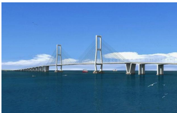
Plate 2. Suramadu Bridge

A significant rise in arrivals to Madura Island, especially to the bridge area, has possibly been triggered by curiosity to see what the bridge looks like, the attraction of crossing the bridge and the ease of access the bridge provides (Kurniawan 2010). Considering that the bridge is the most significant project completed by the Indonesian Government in recent times ("Suramadu" 2009), it is not surprising that the Bridge has become a magnet for visitors. News articles with headlines such as: 'Better to be fined than not take pictures at Suramadu Bridge', also clearly describes the excitement the bridge has generated ("Ditilang" 2009).