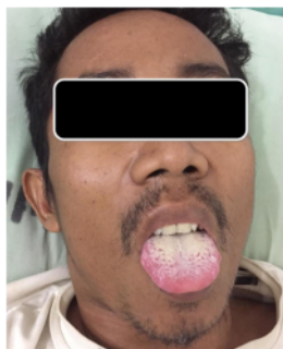
Fig. 2. Clinical picture of the subject on the first day of hospital admission

Culture comparison based on the sex found that most subjects were infected with non- Candida albicans bacteria as much as 55.00% in male subjects, while most female subjects were infected with Candida albicans bacteria as much as 53.85% ( p = 0.035 ). Most subjects were resistant to fluconazole as much as 77.50% in men and 61.54% in women ( p = 0.823 ). The majority of subjects were sensitive to nystatin as much as 92.50% in men and 92.31% in women ( p = 0.167 ; Table 2).