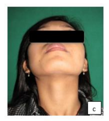
Fig. 1. Extra oral clinical photo: a. Front view, assimetrical face could be detected on the left maxilla region with unclear margin swelling, b. Right view, c. Bottom view.