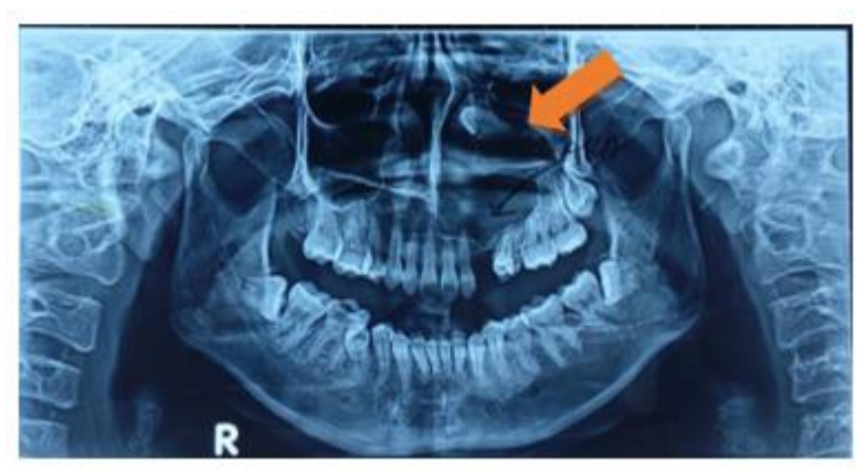
Fig. 3. Panoramic radioimaging showed a radiolucent lesion on the apex of left upper tooth with impaction of 23 at the orbital floor.

From the panoramic imaging, the lesion was radiolucent with a thin radiopaque border, the lesion expanding from 21 to 26 with expansion to the superior direction and reached the floor of the orbita; a radiopaque image from the unerupted canine at the base of the orbita shown.