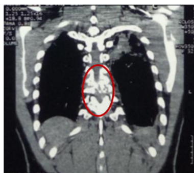
Figure 3. Chest MSCT examination with contrast obtained an image of pulmonary TB, and TS at T7-T8 vertebral levels.