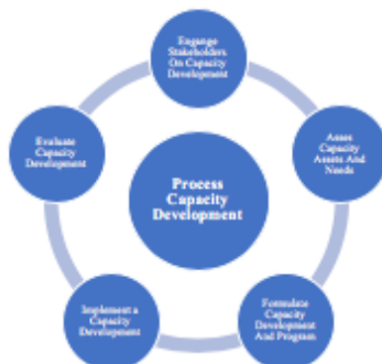
Figure 1: Capacity Development Process

Capacity development is a sustainable ongoing process on a long-term basis so then the learning group target can improve their capability. It is related to the learning that is ongoing within individuals, groups and communities. There are five processes within the capacity development according to the United Nations Development Program (UNDP, 2009), namely engaging the stakeholders in capacity development, assessing the capacity assets and needs, formulating the capacity development and program, implementing capacity development and evaluating capacity development. The following figure explains the capacity development process.