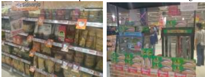
Fig. 2. SME products in X supermarket.

The type of superior product of the Sidoarjo Town which is marketed at X Supermarket is a food and beverage product. SME products marketed can be seen in Figure 2.