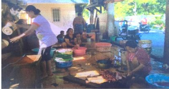
Figure 3: Fish washing process.

Unfortunately, the existence of fish traders caused troublesome among the local people. Various public complaints against the activities of the fish traders such as the smell of smoke that is easily attached to clothing, air pollution, traffic fluency is disrupted, the environment becomes dirty. This issue is ultimately a burden for the Surabaya City Government.