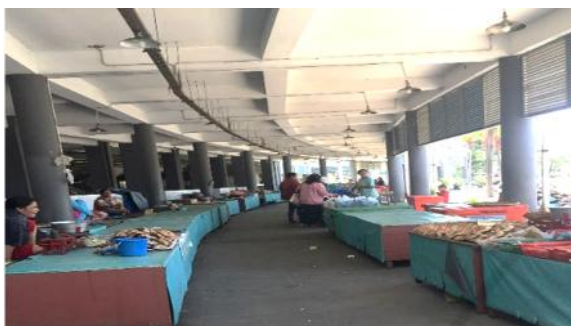
Figure 4: Sentra Ikan Bulak (Bulak Fish Center) is not as crowded as the other traditional market, there is almost no buyer.

Center), but then they went back again to the old location. Subsequent resolution of the fifth conflict was carried out by the sub-district apparatus on July 19, 2016 through negotiations. The result of the negotiation was the expectation of the smoked fish traders for Sentra Ikan Bulak (Bulak Fish Center) location; in addition, there should be the place to sell smoked fish and food products made from smoked fish and entertainment events to attract the public attention. The response of Surabaya City Government is to fulfill all suggestion from the people bloaters, but these efforts have not succeeded until nowadays.