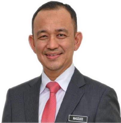
YBhg. Dr. Maszlee Malik Minister of Education Malaysia

I would like to first congratulate Universiti Teknologi MARA (UiTM) in particular the Faculty of Administrative Science and Policy Studies for organising this vital knowledge event and for the hospitality.