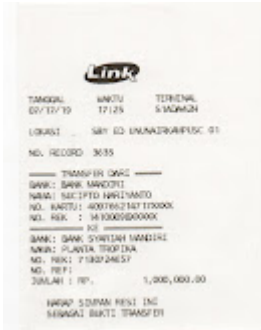
Resi bayar Planta Tropika.jpeg 122K