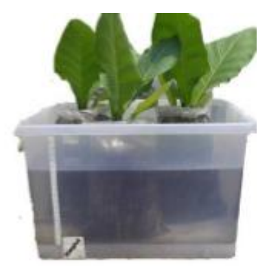
Figure 1. Waterlogging Stress treatment at First Stage