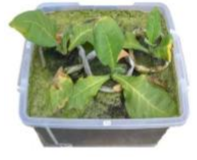
Figure 2. Waterlogging Stress treatment at Second Phase (Partial submergence)