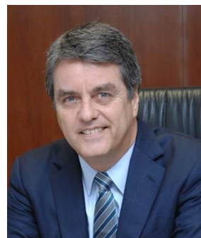
Mr Roberto Azevêdo

This volume is the seventh in a series of annual publications from the World Intellectual Property Organization (WIPO) and the World Trade Organization (WTO). Prepared by the WIPO-WTO Colloquium for Teachers of Intellectual Property, this collection of academic papers represents an important contribution to international scholarship in the field of intellectual property (IP). Today we witness ever increasing, more diverse forms of international interaction on IP, yet equally we see growing attention to differing national policy needs and social and developmental priorities in this field. The Colloquium Papers series highlights the importance of fostering scholarship in emerging IP jurisdictions, harvesting the insights from policy and academic debates from across the globe, and promoting mutual learning through the sharing of research and scholarship on a broader geographical base.