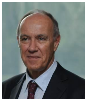
Mr Francis Gurry