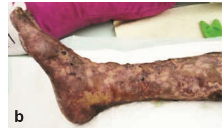
Figure 2. Second case with (a) Loss of eyebrows (b) Hyperpigmented macula with ulcers and erosion at all extremities.