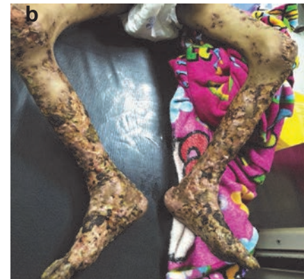
Figure 1. (a) Eyebrow loss; (b) Hyperpigmented macula and plaques at both extremities.