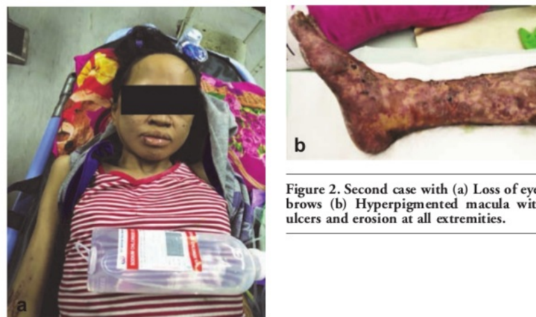
Figure 2. Second case with (a) Loss of eyebrows (b) Hyperpigmented macula with ulcers and erosion at all extremities.