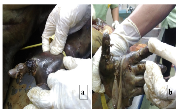
Figure 4: Multiple entry wounds on fingers

On external inspection, the body was found greenish brown skin, skin peeling almost whole body, and a continued corpse decaying process. Burns and injuries on left hand - left thumb, finger (1,2,3), back of left hand (2 cuts); right hand - fingertips 1,3,4,5; six chest cut wounds and electrical burns wounds; stomach - 8 electrical burn wounds (Figure 4 a & b).