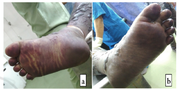
Figure 5: No encountered signs of exit injuries found on feet sole