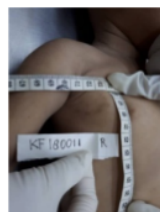
Figure 1 Bite mark on victim's body, near right armpit.