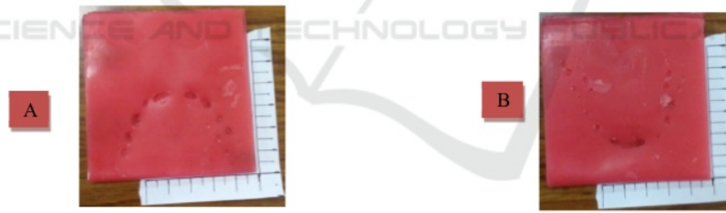
Figure 3 Bite patterns on the dental modelling wax from the suspected biter (toddler's father). (A) upper teeth; (B) lower teeth.

The use of image editing and computer-assisted bitemark analysis has been documented for more than 20 years. The efficacy of such techniques has been tested among forensic odontologists and general dentists. The most commonly used image processing software is Adobe Photoshop (Kieser et al. , 2007), but because that software is not free software, therefore, the authors then did superimposition images using computer software (GIMP 2.0) to compare patterns of upper teeth bite with bite marks on the victim's body, by changing the opacity of the image until both pictures truly coincide and match (Fig. 5).