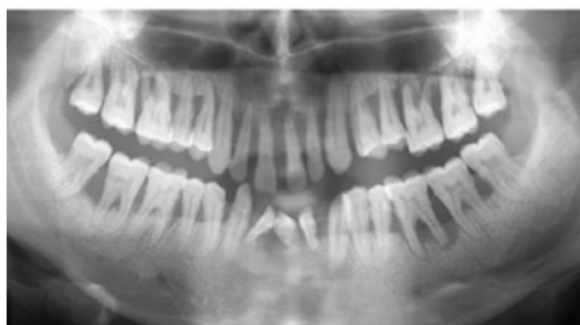
Fig. 2 : Radiographic Aggressive Periodontitis (Nagy et al , 2002).

The diagnosis of aggressive periodontitis is based on history, clinical features and supporting examinations. From the history obtained symptoms of gingival bleeding, tooth shake. From investigations to ensure the bacteria that can cause culture and for radiological examination, radiological picture. An initial examination needs to be done such as the patient's oral hygiene examination, measurement of the plaque index and calculus index (Fedi et al , 2000; Ferry and Richard, 2005).