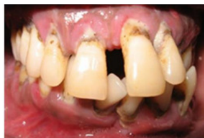
Fig. 1 : Aggressive periodontitis appears clinically (Noack et al , 2004).

Aggressive periodontitis is a destructive and rapidly developing periodontal disease, characterized by rapid damage from periodontal ligaments and alveolar bone, tooth loss, and minimal response to periodontal therapy (Marcuschamer et al , 2009). In this disease, plaque bacteria and calculus appear to be few, not comparable to damage which happens very fast and progressive. Some literature states there is a relationship between damage that occurs with defects in the immune response and genetic factors (Fedi et al , 2000).